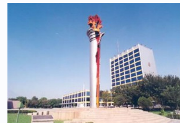
Autonomous University of Nuevo Leon, site of the Congress